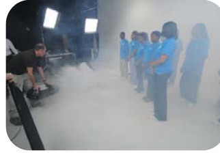
TATU students film public service announcement