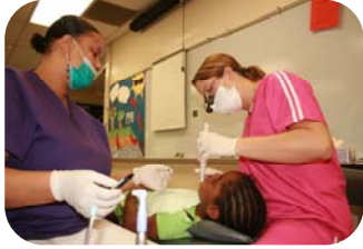
School based dental program