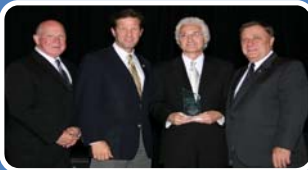
FPCC Dental Organization