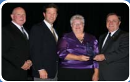
Crisis Nursery Not for Profit